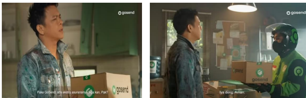
Figure 3. Insurance from GoSend when sending goods

The words used in this advertisement such as "if you pack it, don't bother, bro" are a depiction of product packaging that is considered complicated and convoluted. In society, this is a common thing where people pack their goods with thick tape in the hope that the product will be safe. Not infrequently, people also use wood to pack their products which is considered bad and requires extra effort to pack it. In this advertisement, the advertiser offers practical packaging using a box specially designed for its customers. The word "practical" in the offering of a brand or product is an important thing that everyone wants, especially in today's online era and can make all life's affairs easier and faster. In this way, it won't cost more just to pack.