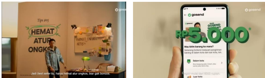
Figure 4. Advertisements offer affordable prices for using their services

goods that will be sent using Gojek Indonesia because they offer insurance if the goods are lost or damaged during the shipping process. . People are certainly more interested and think that their goods will be safe until they reach their destination, even if not they will receive compensation for the goods they will send via Gojek Indonesia.