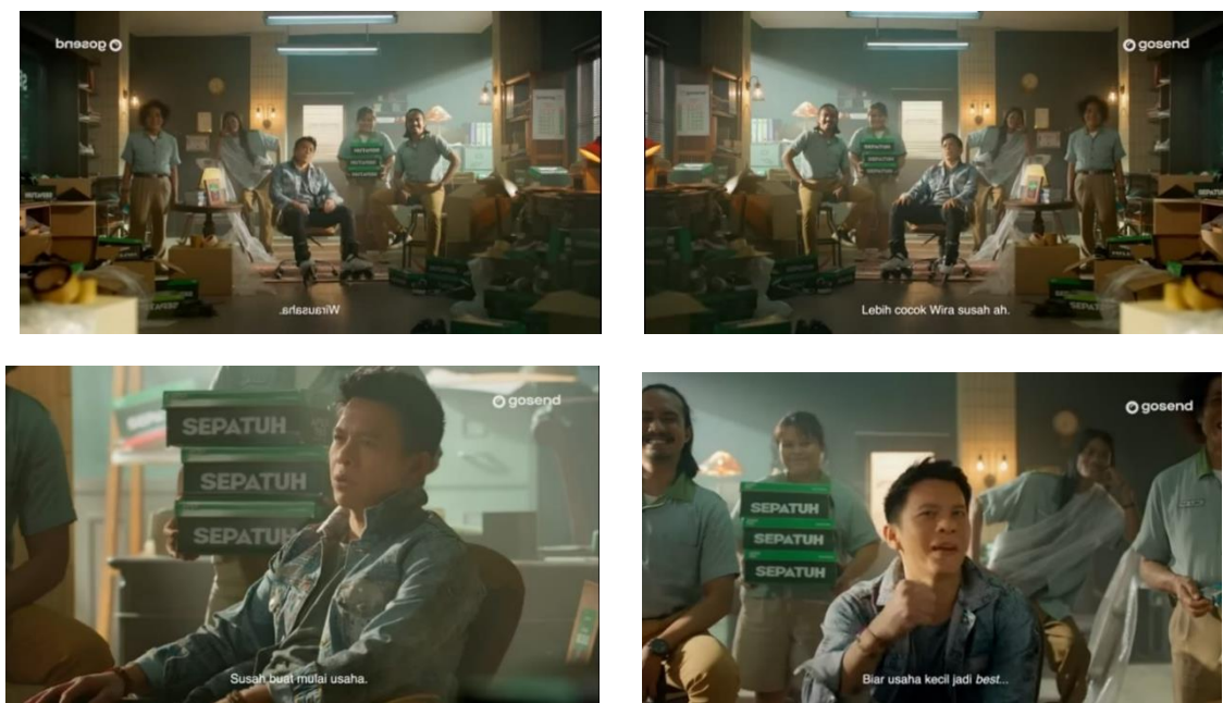
Figure 1. Opening advertisement that illustrates the meaning of the word entrepreneur

To see how the selected advertisements are influenced by social conditions in society, the researchers will present several images capture from the Gojek Indonesia #BestSellerGoSend Bareng Ariel Noah advertisement to see the social practices contained in the advertisement.