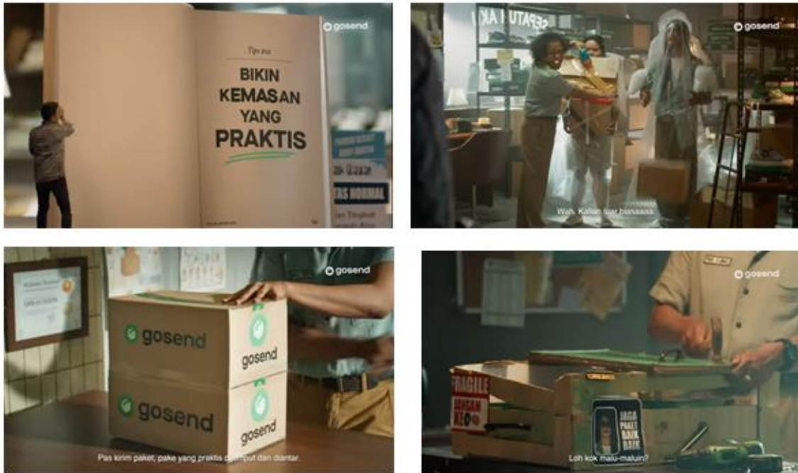
Figure 2. Offering practical packaging to customers

entrepreneur where the words contained after it are "more suitable wira sulit ah. It's hard to start a business". This is because the advertiser knows that the public's pessimistic attitude to starting their own business is still small. Many doubts arise such as fear of no buyers, fear of running out of money for business costs, and fear of losing to other people's businesses. The word "entrepreneur" can be very powerful because many Indonesian people have jobs as entrepreneurs with their own businesses. This illustrates that people in the social environment in terms of building a business, like to find out tips "so that the business becomes big, sells well, and is in demand by many people. It is not uncommon for fellow entrepreneurs in Indonesia to exchange ideas in terms of the business world. Therefore, the social practice contained in the advertisement above is the biggest problem in society, namely the difficulty of starting a business.