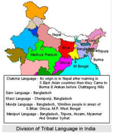
Figure 3. Division of Tribal Language in North Eastern India

Tribal communities have rich cultural and linguistic diversity. This diversity should be seen as an asset rather than a barrier. Educators need to appreciate and incorporate these cultural nuances into their teaching methods to make learning more relatable and engaging for tribal learners. According to the Indian Encyclopedia, "Tribal people make 8.2 percentage of the nation's population, which adds to over 84 million people, according to the 2001 Indian census. Indian tribal language can be defined as essentially 'folk' languages, possessing no literary specifications of their own and spoken by people of ethnic groups who prefer to live in relatively isolated groups" (India Netzone, 2011). The different languages spoken by Eastern Tribal sects in India are depicted in Figure 3 .