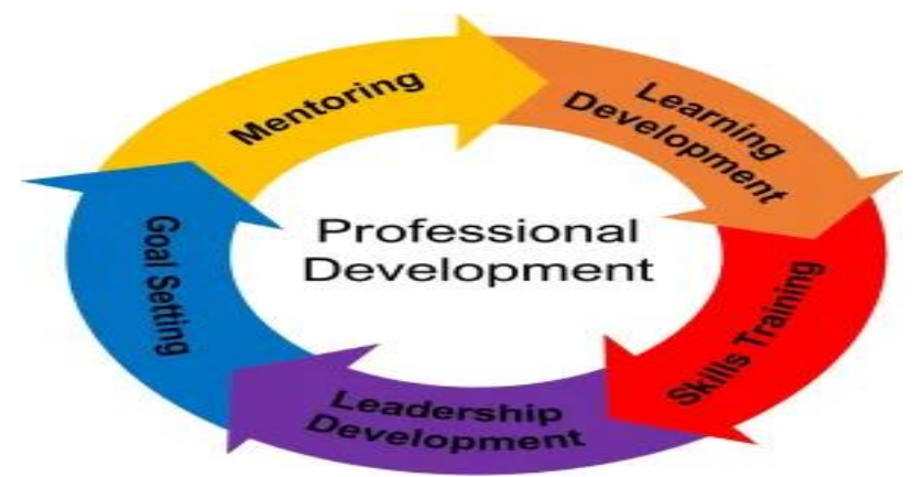
Figure 5. The Modes of Professional Development

A teacher should be considered a craftsman. The development of a teacher should be evaluated based on three basic ideas: methods of teaching, techniques of teaching, and strategies of teaching. A teacher can create and identify his/her agenda for professional development; this agenda should address the ideas related to human development, learning, and decision-making. To establish an identity as a teacher, professional development is a prerequisite. Teacher development can be achieved in many ways, incorporating institutional practices, materials, pre- and in-service courses, and many government-initiated programmes and policies. The following figure is from the official website of the North American Stamping Group who offers the following initiatives as part of their professional development: