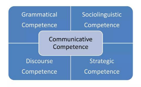
Figure 2. The Four Dimensions of Communicative Competence

Teachers who speak English in the classroom ideally satisfies two purposes— communication as a discourse for classroom management and as a discourse of input. The response of the learners should also be in English and it should be evaluated not on the basis of accuracy, but on the basis of fluency. The only way to ensure the progress of English language communication in classrooms is to focus on the fluent responses of the learners. The most important fact is that English communication in classrooms is not only the objective of English classrooms, but for all the classes, except the other language classes. It is a myth that English communication and the increase of competency in the English language is the responsibility of English teachers alone. It is the duty of teachers in all subjects make English universally acceptable, since the English language is adequate in allowing personal expression around the world. Thinking beyond the four walls of classroom teaching, learning will likely support this view.