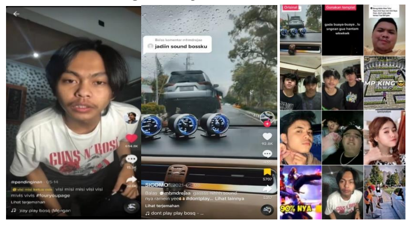
Figure 6. Stills of videos by @pendinginan, @sicomo.2gd, and audio replication.

Content Level. The video produced by @pendinginan was an imitation through lip sync. At the content level, this meme showed the setting of a place resembling a room in the house. The audio used was different as it had undergone a remix process. As the video played, the intro of the accompanying audio appeared slowly from the right side of the screen. The person positioned himself standing and lip-syncing from the sound Don't Play Play Bosku which had been changed from @sicomo.2gd. This account remixed the sound, and the result was then used by @pendinginan. The sound Don't Play Play Bosku from @sicomo.2gd has been used 84.9 thousand times to date. Based on this chronology, @sicomo.2gd became the second party in the sound replication. At the time of the study, the video by @pendinginan ranked tenth among the users of the sound from @sicomo.2gd. Meanwhile, the video by @pendinginan indicated no replication since the sound was taken from @sicomo.2gd.