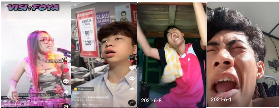
Figure 7. Stills of videos by @djtessamorena, @hao, @jajatheeeee, and @kadekedwan.

Content Level. The creator @djtessamorena_real replicated the text Don't Play Play Bosku through the music she controlled. The text Don't Play Play Bosku later became DJ Tessa Morena's repertoire. Therefore, it can be concluded that the audience has not taken into account the ownership of the text. Until this analysis was conducted, the researcher found that this meme has been viewed 13.6 million times with 511.3 thousand likes, saved by 36.2 thousand users, and shared 46.7 thousand times.