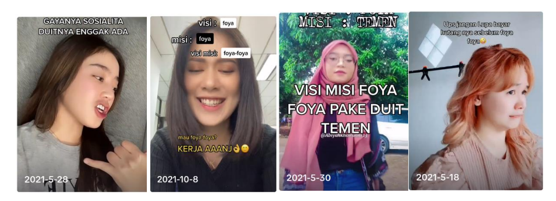
Figure 8. Stills of videos by @tasyarev, @nataliave407, @abiyahkhoirunisa, and @tennytap

Form level. The creator placed the narrative at the top of the video, parallel to the finger pointing at where the text was positioned. This video was created using zoom-in and zoom-out effects. The final section was closed with a zoom-in transition to the sound of repeated laughter that became the highlight of the video. Without wearing glamorous and excessive clothes, with the setting of the background, these four creators only relied on satire in their videos.