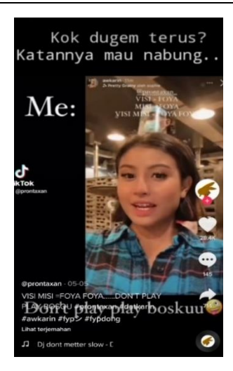
Figure 5. Stills of Awkarin by @prontaxan.

Awkarin is a symbol of the upper social class who likes to live extravagantly and exhibit hedonism in the media. Therefore, the text "Don't play play bosku" that tends to be uttered by an influencer will have the potential to become viral content, and it can be replicated then become meme content. Although the text was uttered by Awkarin as an actor of the upper social class, it did not necessarily represent Awkarin's real life. This can be seen from various documentations in the media depicting Awkarin as a decent sort of person. In October 2018, she went to Palu, Donggala, and Sigi for a disaster relief activity to help earthquake victims. She also showed such involvement again in April 2019 by volunteering for the tsunami relief in Banten. Awkarin also shared logistics for the demonstrators at the House of Representatives. She is known as a philanthropist. Everything seen by the audience does not necessarily represent what Awkarin has done. Her advice "visi foya misi foya visi misi foya foya" might be a mere speech or simulation. However, it is also possible that Awkarin's attitude apply to both going on spree and being philanthropic.