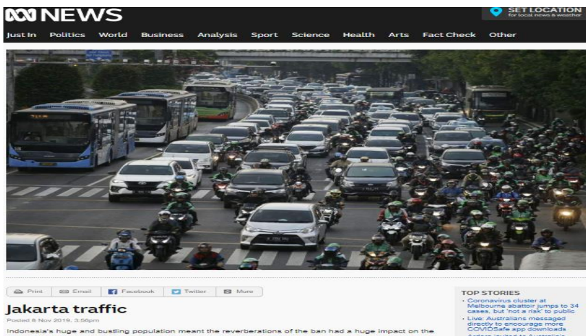
Figure 2. News of Traffic in Jakarta, Indonesia