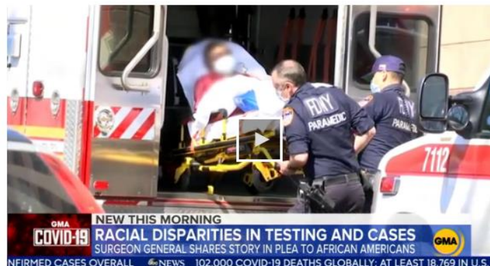
Figure 1. News Title about Indonesia in the Australian