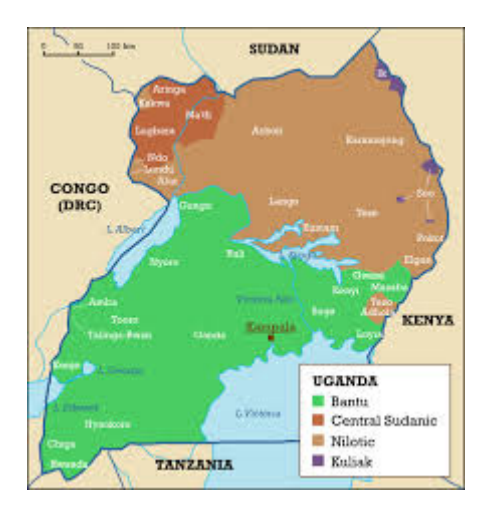
Figure 1. Ethno-linguistic Map of Uganda showing major Language Classifications