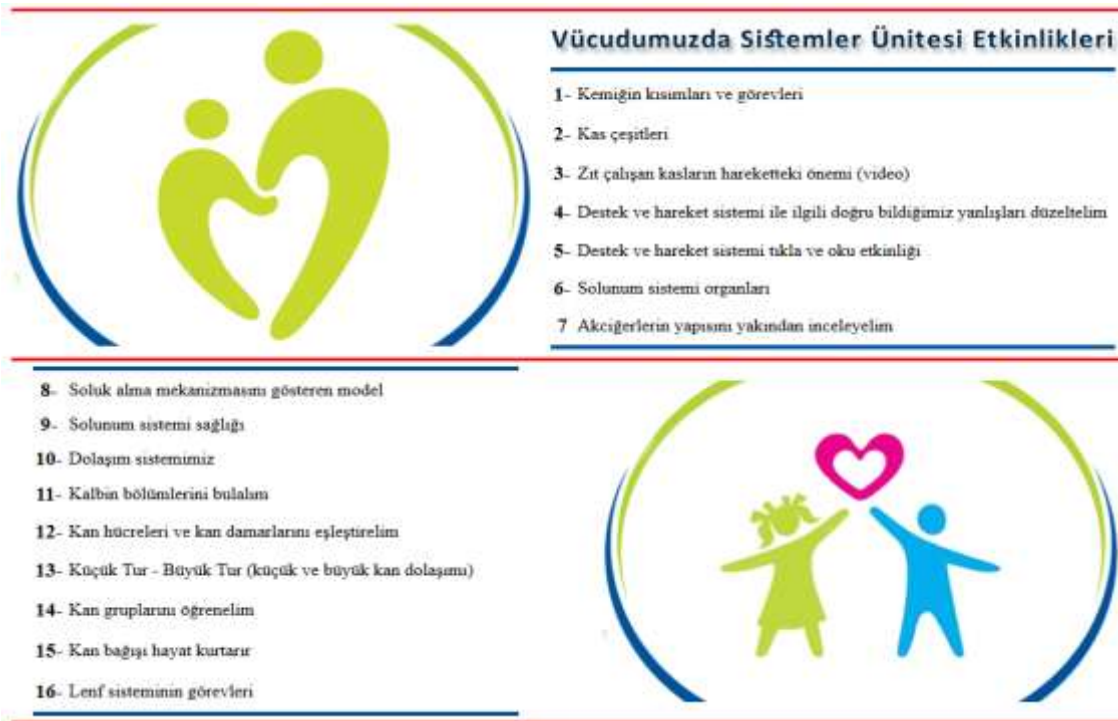
Figure 1. Outlook from the interface of "Web Assisted Activities" material.

Principles and strategies adopted by constructivist learning theory were used in the design of the web material we prepared. Adobe Flash CS6 program was used to prepare the material and Adobe Dreamweaver CS6 web edit was used for web. With the material prepared, activities suitable for the unit "systems in our body" were developed (Figure 1)