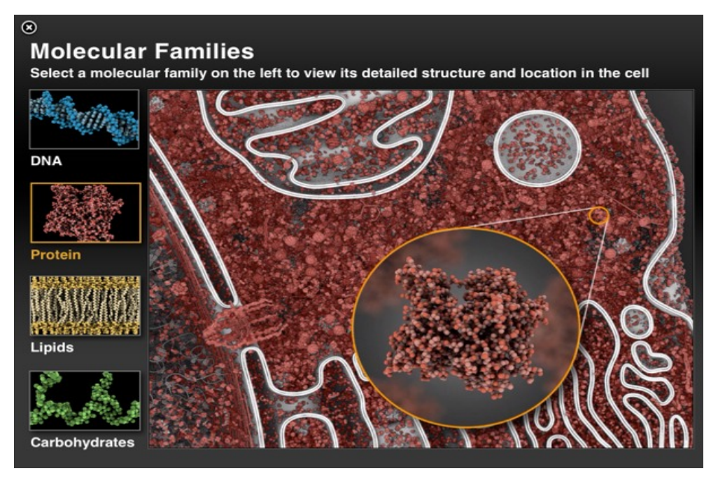
Figure 2. Screenshot of a molecular families animation

It is likely that each of us has experienced the traditional science text composed of text and typically static graphical elements (Slough, et al. 2010). The MTT adds interactive graphical elements, characteristically with sound and a variety of interactive features that are reminiscent of enactive (learning-by-doing) mode of learning (Bruner, 1961). These interactive/enactive elements extend a traditional text and graphic reading experience to include active participation in the "reading." Examples include things such as simulations, animations, and even internal assessments (see Figures 2 and 3). In particular, animations and assessments include active choices that students' make that enhance their reading experience.