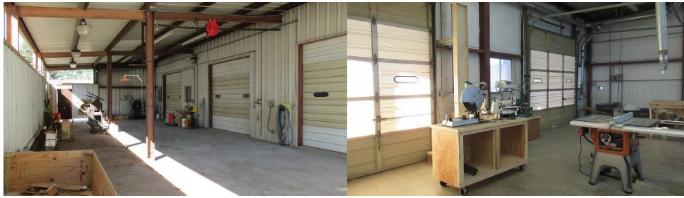
Figure 2. The concrete lab facility used for the study

The lab component of the class (counts for 75%) enables the instructor to group students based on specific concrete and masonry activities and apply pedagogical strategies such as discovery-based and hands-on learning by assigning different roles to students. The class was taught by the author twice, first in the Spring of 2020 and the second time in Fall of 2021. The active learning pedagogies were incorporated into the Spring of 2022 class. Most of the students tended to memorize information based on repetition. Although they could quickly recall basic facts, it did not allow for a deeper understanding of subjects. It was also noticed that there was no connection between new and previous knowledge, although students enjoyed the opportunity to do a hands-on project. To make stronger connections between old and new knowledge and also to make the most of the students' time for face-to-face classroom interactions, the author decided to use pedagogical practices centered on learners. The goal was to encourage students to think creatively when solving problems as well as increase their confidence when solving problems.