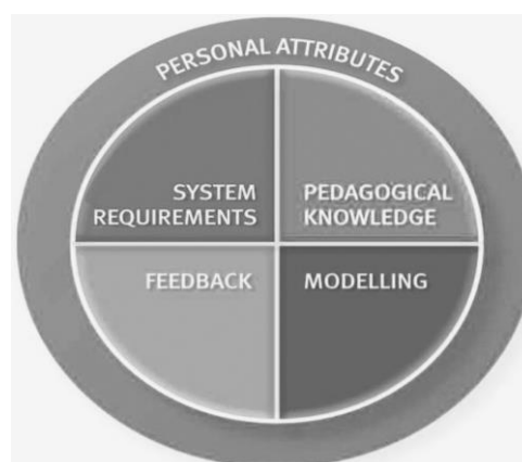
Figure 1. Hudson's Five Factor Model of Mentoring (2003, 2010)

The study focused on mentors' perceptions of their own mentoring attributes and practices. The aim of the study was to