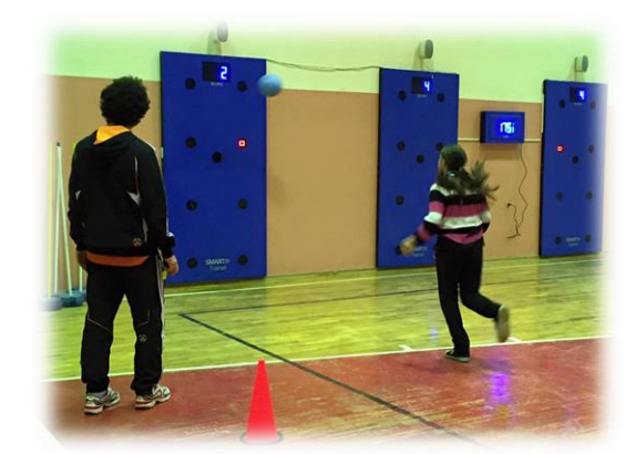
Figure 2. SMART Trainer System in Sports Hall of T.E.K Secondary School