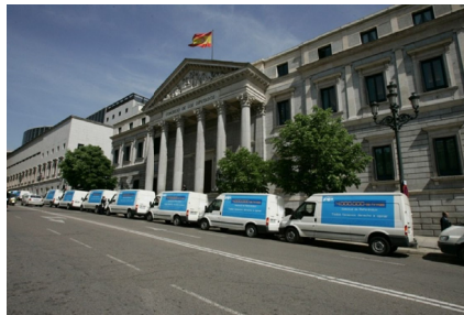
Figure 2. Vans as shown in the newspaper

All Spanish newspapers published pictures with the big boxes and the 10 vans needed to transport the sheets of paper to the congress. Do you think there was a political intention behind this staging or were all these boxes and vans really necessary to carry the 4000000 signatures? (See Fig. 2)