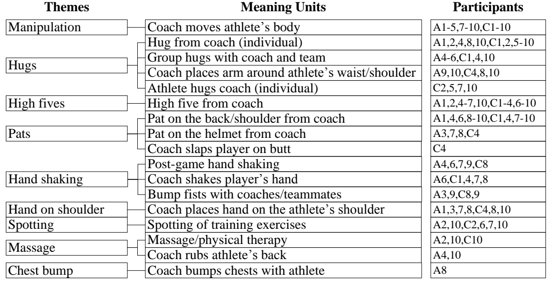
Figure 1. Examples of Positive Touch

When asked to provide examples of positive touch between themselves and their coach, all of the athletes were able to identify examples very easily. As seen in Figure 1, the most commonly cited examples of positive touch between the athlete and the coach included: manipulation of the body, hugs, 'high fives', pats, hand shaking, a hand on the shoulder, spotting, massage, and chest bumps.