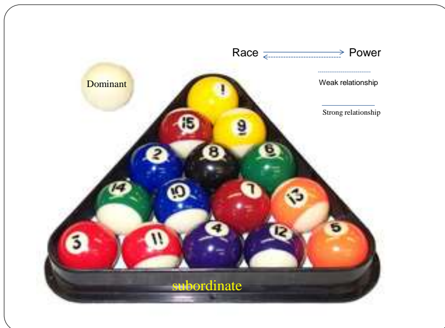
Figure 1. Power Distribution in the Pool Theory

One might argue that the game was originally an outdoor game and played in grass, and since the black color was less visible in grass, it was chosen to be the last ball to enter the pocket. In contrast, the white ball was selected as a responsive game breaker because of its visibility. However, nowadays, many players choose to use yellow or orange balls in a game of golf, which is played on grass. Additionally, if the least visible color was consciously chosen as the last ball and deciding factor, why was the green ball that was the least visible color in grass (as originally played) not selected? (Figure 2).