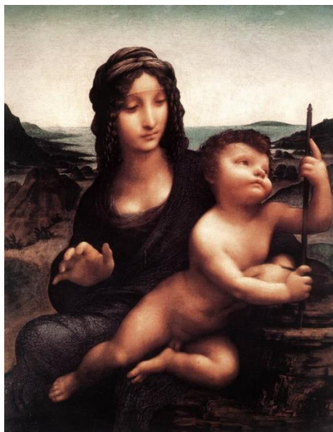
Figure 1. “The Madonna of the Yarnwinder” by Leonardo da Vinci

The object of this research is “The Madonna of the Yarnwinder” (Fig. 1).