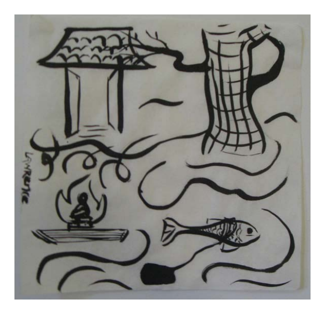
Figure 8. Artwork by Lawrence Szalay, 2009

Despite the fact that they were using art materials that were unfamiliar to them, students demonstrated an ability to easily express themselves in a variety of ways. According to the reflections of many students, key elements of the film that are important in Korean culture resonated with them and were depicted in their paintings. These included elements of nature, the idea of continual growth and rebirth, meditation, and a feeling of "oneness." By identifying key metaphors and symbols and incorporating these into their own works, students were able to explore another culture, identify personal connections, and think critically about its meaning.