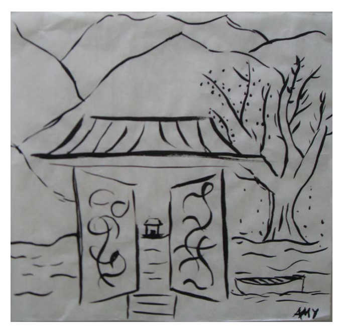
Figure 4. Artwork by Amy Grady (2008)

Student Christina Delaney (2008) said about her artwork (see figure 5), "I represented the great mountains and delicate yet strong trees in my brushwork, which was inspired by the landscape shown throughout the film."