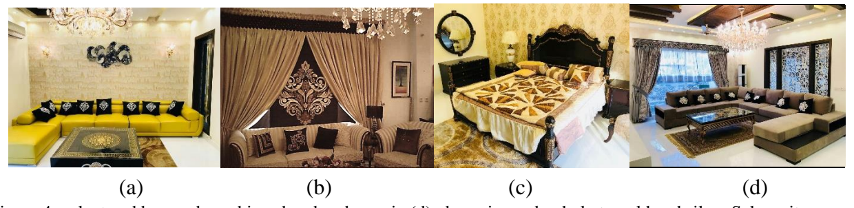
Figure 4. velvet and borocade cushions, handmade rug in (d), dreperies and upholsrty gold and silver Salma sitara work with diamatics stones

These elements are enriched with solemnest and gracefulness. These include the characteristics of the Pakistani interior in house having engraved patterns or designs, carved furniture, and other characteristics stated above. This is liked and lived by the people living in their houses and enlightens the spark of life in human beings. Furthermore, the people are focusing on the transmission of the visual effects retrieved from the traditional and modern combinations and they have controlled to get the things accomplished well in contrast and matching colors. Figure 4