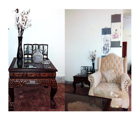
Figure 8. chines wall hanging and decoration accessories on traditional carve wooden table, chines influence in decoration 5.5 Housing Societies

Interior style and decoration concepts in Pakistan are typically dependent upon the approach individuals house are designed and what area of Pakistan individuals have a tendency to live in. Pakistani architecture reflects the cultural variety and distinction in style the country has intimate with through the ages. The past is represent in the wide span of architectural structure and in decorative style that utilize a distinctive mix of creative inspiration, material, layouts design, workmanship and construction. Details of Pakistani house style given in Table 3.