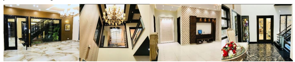
Figure 9. interiors of developed housing societies use of marble, wall paper and wood work

Furthermore, planning interior of a house depends a lot of on the budget homeowner has. Through survey in housing societies, made interview with architects whom associate with different architectural and interior design firms established different parts of Pakistan, and somehow that Pakistanis attitude and mindset have generally for the most part been influenced by British colonial past and European style. European and British influence has modified the approach that Pakistani individuals glance at themselves and in some aspects loose of a confidence that comes naturally from ancient and majestic civilization. Although, people wants variety with Perfect Blend of Old and new or mix and match with traditional designing décor style. Therefore, advancement in new housing society, improving lifestyle and gaining new knowledge, and use of technology, wants to acquire more than one style approach which portrays the finest living in developed housing society because of safety and security and leading comfortable life with all facilities. The better designs of Pakistani houses have capacity to develop better interior decoration space which look unique and may become a symbol of status. Figure 9