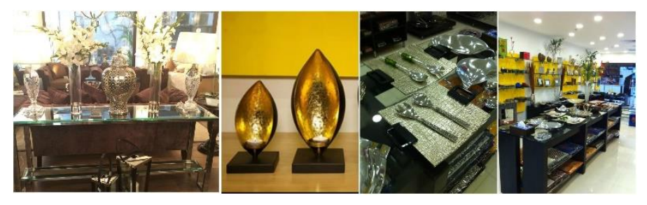
Figure 5. Imported decorative objects in home décor store Pakistan