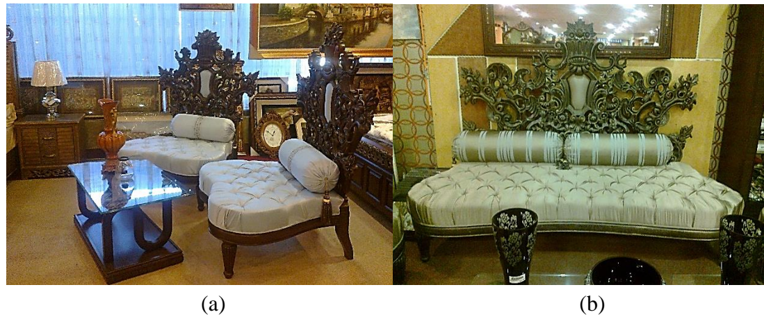
Figure 3. Victorian style dark finished, elaborate wood carving, combination of Islamic Mughal style like low seat divan and throne with brocade upholstery and cylindrical elongated cushions depicting Islamic Mughal style

These elements are enriched with solemnest and gracefulness. These include the characteristics of the Pakistani interior in house having engraved patterns or designs, carved furniture, and other characteristics stated above. This is liked and lived by the people living in their houses and enlightens the spark of life in human beings. Furthermore, the people are focusing on the transmission of the visual effects retrieved from the traditional and modern combinations and they have controlled to get the things accomplished well in contrast and matching colors. Figure 4