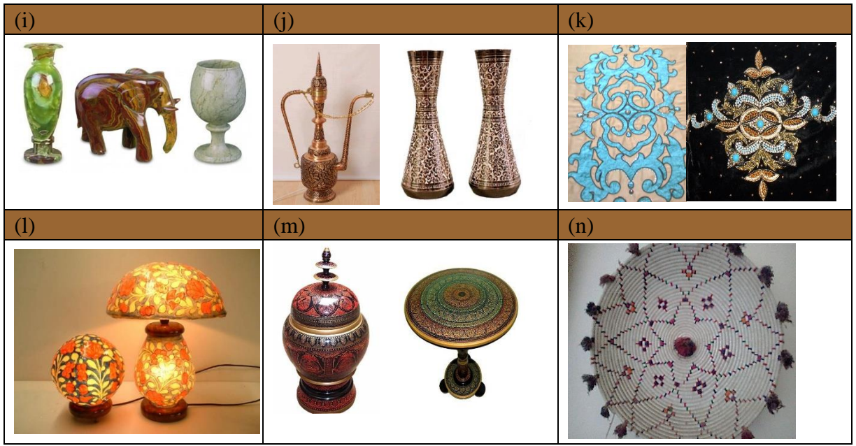
Figure 2. T Elements of Traditional decorative art and craft

(a) glazed tiles (b) engraved floral patterns with Islamic calligraphy metal decorative art (c) handmade rugs (d) brass inlay work(e) mache work (f) wood carving (g) marble work with brass art (h) glazed painted pot (i) onyx art work (j) brass engraved inlay vases (k) salma sitara work (l) camel skin lamps art (m) laquer art work (n) basketry chabi art