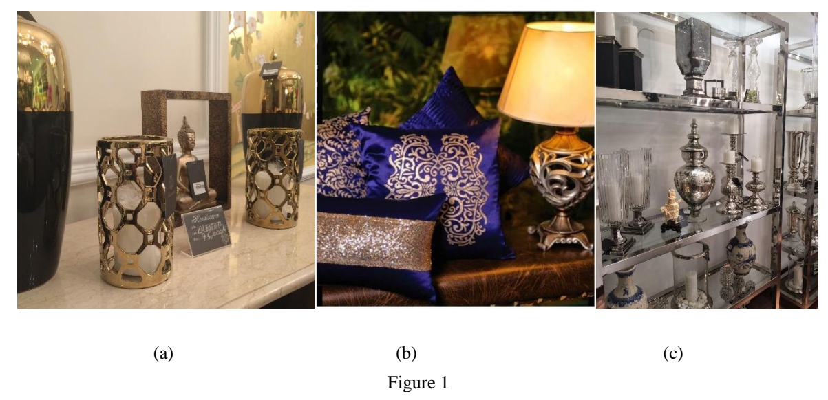
(a). Pakistani Contemporary and classic decorative accessories Buddha sculpture in decor store (b). silk Mughal style cushion with floral patterns

traced in architecture, painting, metal work and other Islamic decorative art. Most of the Islamic art of, whether consists of architecture, literature, textile, ceramic and others elements, is the art of ornamentation – so called, of transformation The Evolution of Style (David Wade, 2006) Due to the spread artifacts of the ancient civilizations and glorious Islamic Mughal history design preferences a wide range of trends in designing can be observed in different parts of Pakistan in modern time which are given in Figure 1: