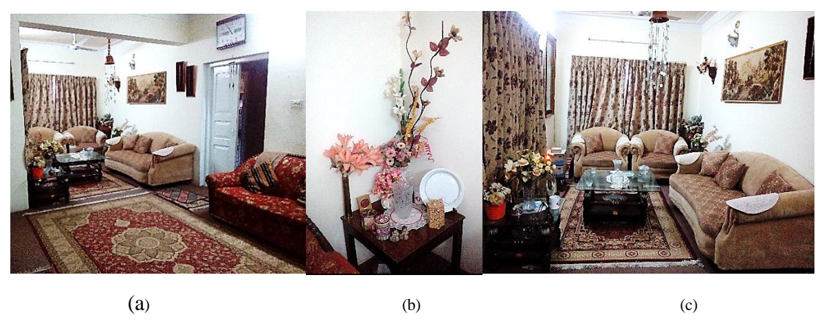
Figure 6. vareity of ornamenetal objects antique brass (peetal)vase and wall hanging ,islamic traditional glazed painted decorative vase and plates and handmade pakistani traditional carpets and rugs

Through survey based on interviews and observation has noticed that Pakistani individuals starts begin picking out their favorite items within the available resources like interior design images from net or magazine or from any TV dramas serials (drama series like tele film serials which very popular in Pakistan). Mostly women watch and get inspiration from it weather in fashion cloths or interior design such as furniture articles, lamps, wall covering, window treatment or anything similar else that they wish to place in existing interior space in home once they picked their favorites decorative ideas, thus start shopping and searching for selected or similar items in showrooms, handicraft shops and decorative local or imported accessories item shops. Pakistani interior design and décor style is somehow an eclectic style in which use variety in the interior decoration. Somehow, Pakistani interior decoration style is that put together in home follow the different time period, several styles in furniture items and accessories combine or blend together. Some extend Pakistani decorative interior style is great to use with a limited budget, because of have many design options, variety of style and products availability to incorporate them all at once in interior space .fig:6