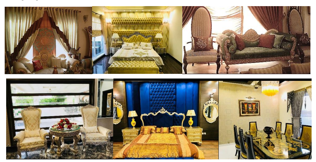
Figure 7. Heavy Victorian style and gilded furniture with highly elaborate draperies and upholstery with traditional bed sheets prints and silver and golden salma sitara motifs on cushions and Pakistani traditional brass (petal) work in table lamps

Furthermore, new technology use in Pakistani construction and interior design that are adopted in a greatest extend in the recently launched housing societies in different cities of all provinces. It additionally depends on individual budget keeping in mind as Pakistan is expensive towards hire designer or decorator, buying branded article of furniture and interior decorative materials. New developed Pakistani housing societies and industrial revolution development transformed the living standard of middle class families specially those who came in the field of real estates and builders that make them more prosperous. Hence, for showcasing of their wealth Victorian and baroque style furniture with overly ornamented and highly detailed use with Mughal influence are more common .furthermore use of heavy draperies and upholstery became the priority style of furniture in order to fulfill the interior decorating requirements of the newly prosperous living. Fig: 7