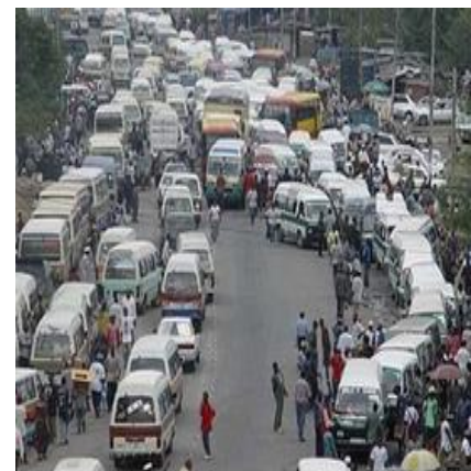
Traffic congestion in Dar es Salaam city