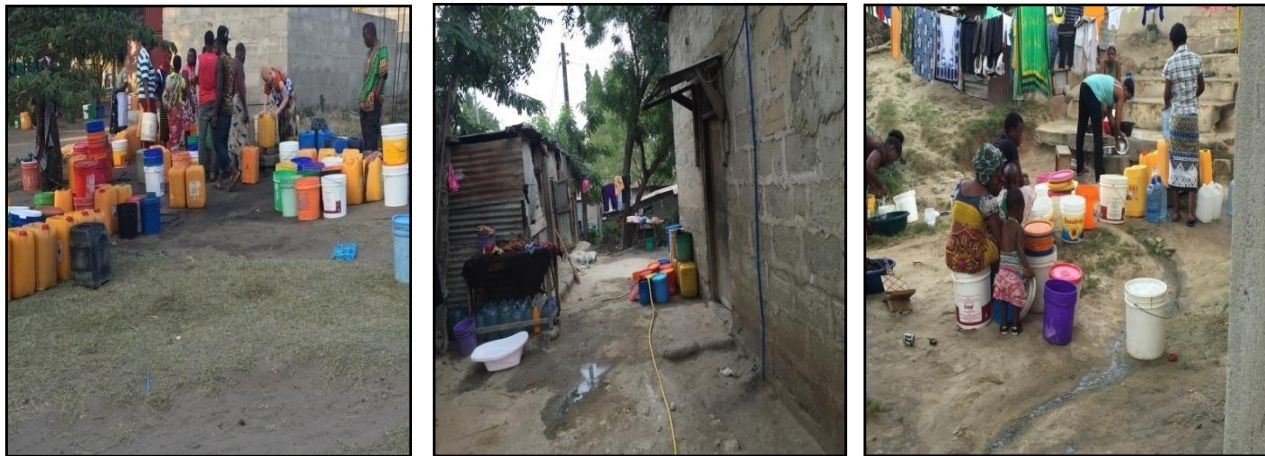
Figure 3. Communal water tapping point (left), Individual illegal water connection (centre), and Private Water tapping point (right)