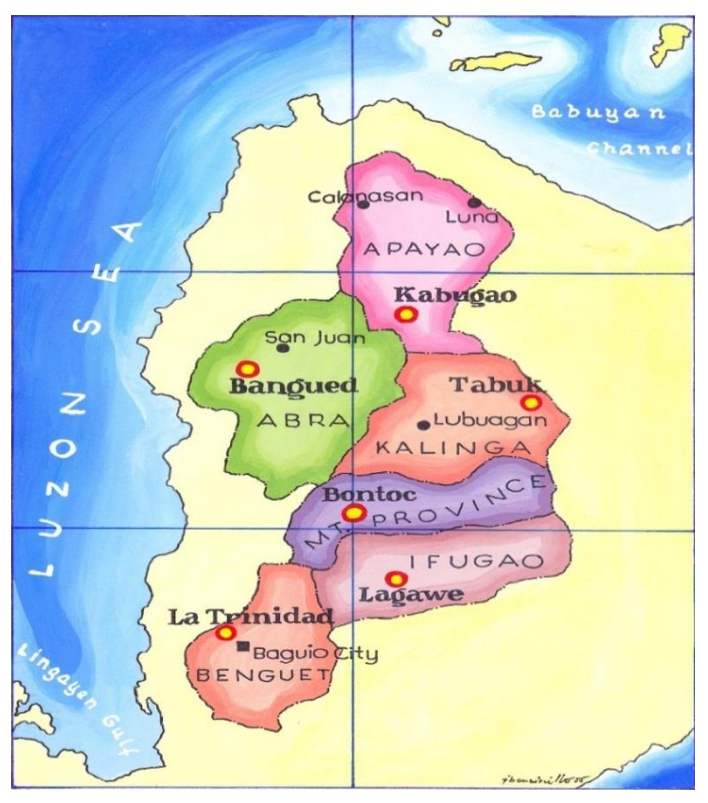
Figure 2. Map of Cordillera Administrative Region

The research study focused on the six (6) provinces to include the two (2) cities in the Cordillera Administrative Region, namely: Abra (tinggian tribe [itneg, binongan]), Apayao (isneg tribe [isnag, apayao]), Benguet (kankanaey, iyaplay, bontoc, ibaloi [ibaloy, nabaloi], and karao [karaw] tribes), Ifugao (ifugao [ifugaw, ipugao, yfugao], and kalanguya [ikalahan]), Kalinga (with Tabuk City) (kalinga [limos, limos-liwan kalinga]) and Mountain Province (kankanaey, iyaplay, and bontoc tribes) as well as Baguio City as the regional center. Igorot (people of the mountains) is the mainstream, collective name of several of the tribes in the Cordilleras. The various indigenous groups are spreadout through the Cordillera (Philippines: Indigenous Peoples of Luzon/The Cordilleras, 2018).