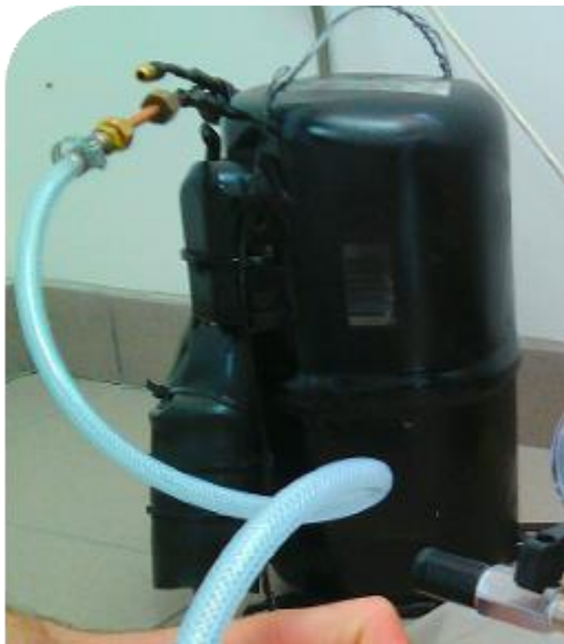
Figure 2. The compressor used in our work, before assembling it within the vacuum generator