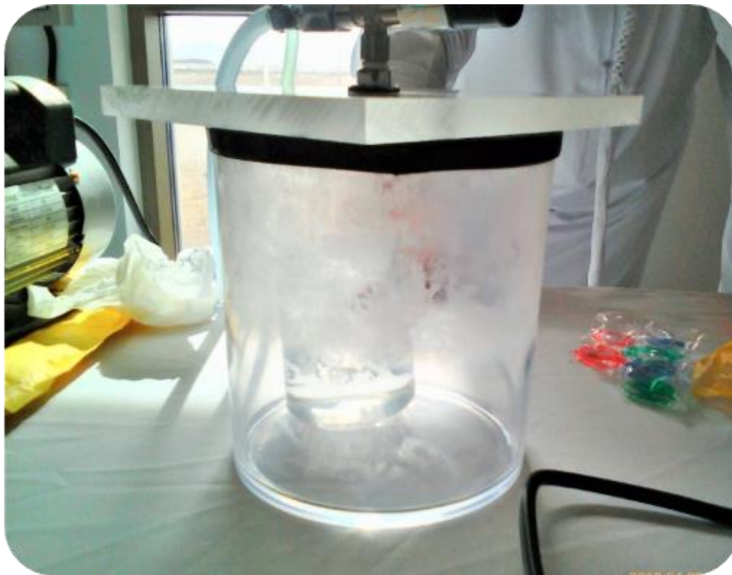
Figure 6. Cold boiling inside one of our chambers