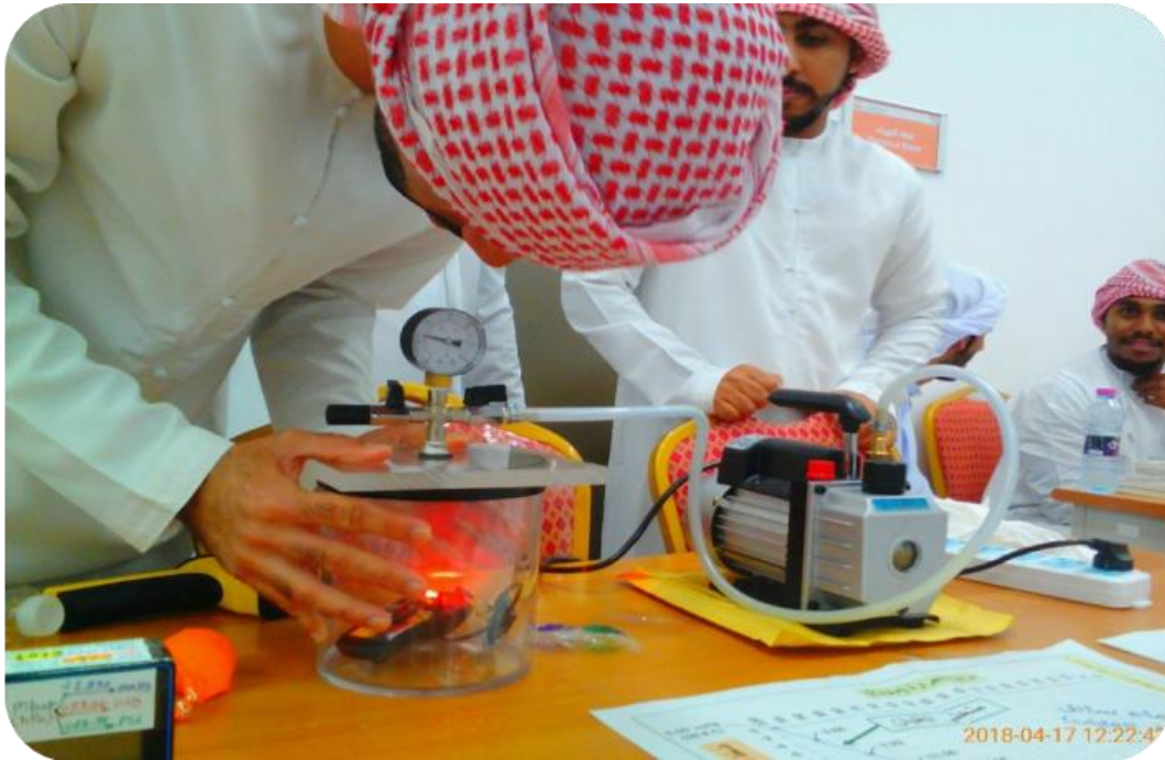
Figure 8. The sound wave propagation experiment