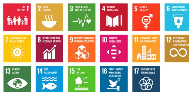
Figure 1. Sustainable Development Goals

SDGs is an abbreviation for “Sustainable Development Goals”, which were adopted at the United Nations Sustainable Development Summit in September 2015. They were set as goals to be achieved by the 193 United Nations Member States during the 15-year period from 2016 to 2030 (United Nations, 2021). Specifically, SDGs include 17 major goals and 169 specific targets to be met to achieve those goals.