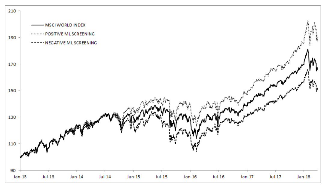
Figure 1. Simulated strategy

These two combined results show that the machine learning algorithm is clearly able to distinguish between opportunity stocks (the ones with positive scores) from risky stocks (negative scores). Figure 1 shows the historical behaviour of these two portfolios and the benchmark. We notice that the Positive ML Screening outperforms the Negative ML Screening over time, with the benchmark in between. Furthermore, in years when the benchmark shows very high performances with very low volatility, typically in bull market regimes, the differences between the two strategies are less pronounced. On the contrary, when the market is in bear regimes or it does not have clear trend, the Positive ML Screening clearly outperforms its negative counterpart, as shown in Table 11.