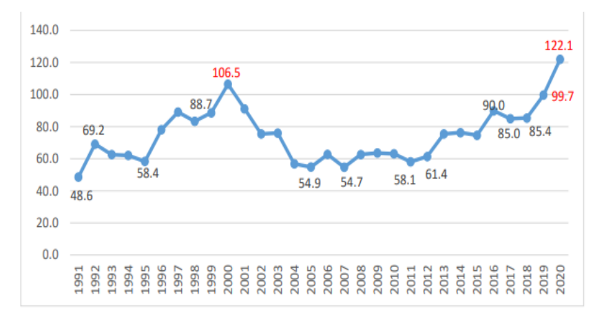
Figure 1. Illustration of the sum of the government debt payments and compensation of employees as a percentage of total revenues and grants received by the government over the 30-year period from 1991 to 2020

Fourth, democratic political transitions in Ghana are increasingly associated with governmental actions which destroy businesses such as banks, factories, finance companies, radio and television stations, and schools of indigenous elites, who are perceived to be opponents of the ruling party (Anaman, 2016), leading to the losses of thousands of jobs, and ill-health of these elites, and early deaths of many workers formerly employed by their businesses.