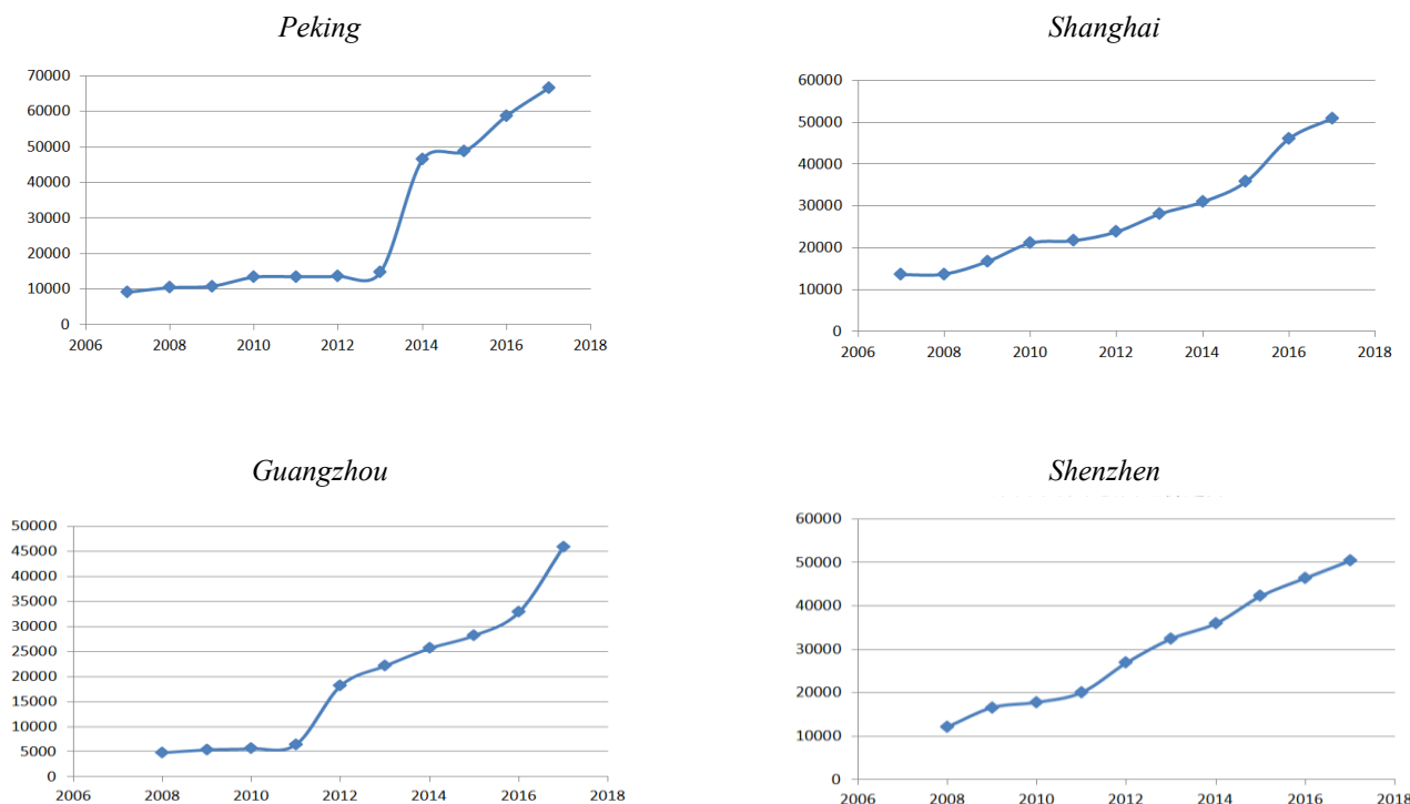
Figure 1. Four Cities' Land-offerring Price

This model in this paper only pushes forward to the annual average price in 2017, and the floor price data is only used until 2014. Disturbingly, the floor prices of the four cities in Beijing, Shanghai, Guangzhou and Shenzhen reached 46,426 yuan per square meter , 30,979 yuan per square meter, 25,625 yuan per square meter and 35,963 yuan per square meter, respectively in 2014. While the floor prices of the four cities in Beijing, Shanghai, Guangzhou and Shenzhen had risen sharply to 6,579 yuan per square meter, 50932 yuan per square meter, 45,905 yuan per square meter and 50,397 yuan per square meter in 2017. The increase is faster than before, and no slowdown has yet been observed. The increase is faster than before, and no slowdown has yet been observed. We can imagine that the prices in 2018 and 2019 will surely face a more rapid rise.