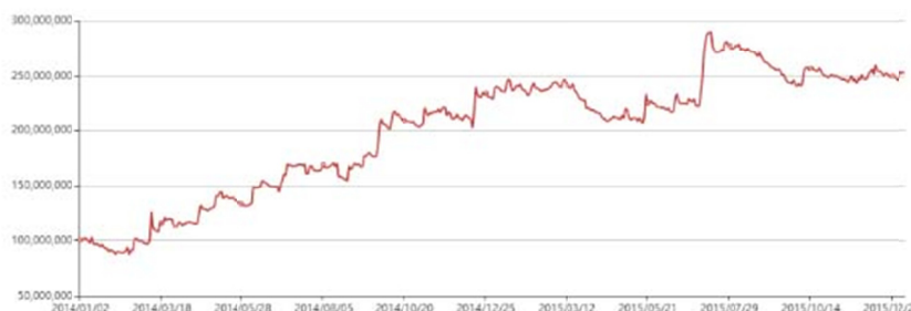
Figure 2. The Total Profit Curve

We can see that the trading strategy can be used in the glass, cotton, soybean meal, silver, copper, natural rubber, refined terephthalic acid on the seven goods can get good returns, and the retracement rate of 17% ,Sharp ratio of 1.5485, indicating that the risk of this trading strategy is small, while each bear a unit of the total risk, the excess compensation is not low, and the equity curve has grown steadily. The strategy reached a low risk and high profit expectations, achieving the steady growth of assets.