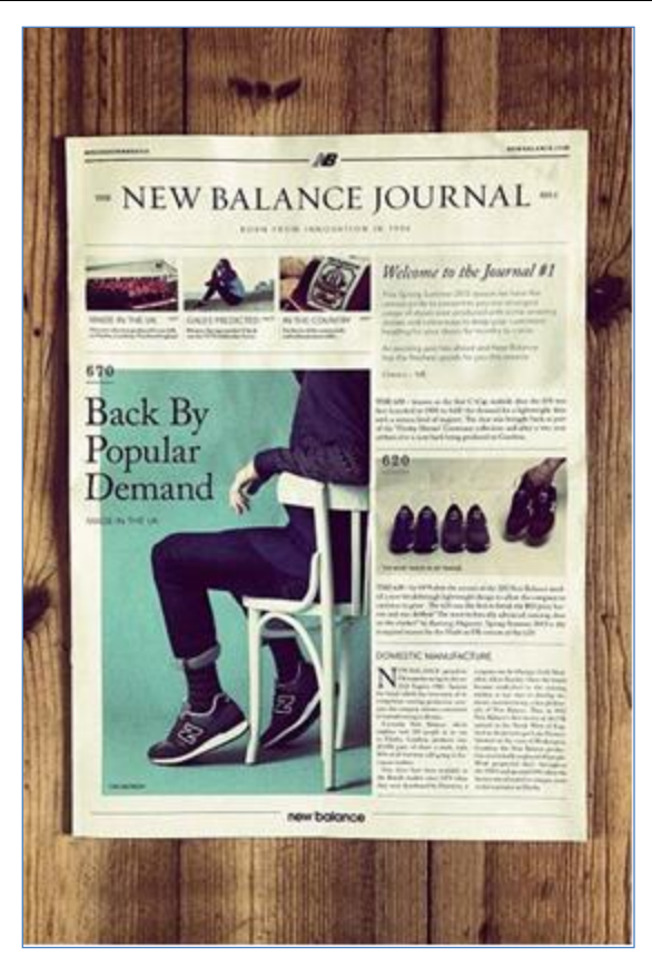
Figure 1. Cover Page, the New Balance Journal 1

This suggests that visualisation has become the new aesthetic in what Massumi terms the feelingvision dimension (cited in Lupton and Miller, 1999). Images as visual stimulation form have immediacy and allure, improving desire to engage. The focus group respondents stated they were primarily attracted by the coloured type element, while white spaces surrounding the text catch attention.