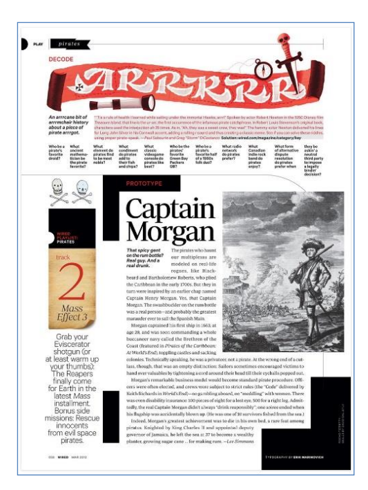
Figure 5. Pirate Magazine Page in Wired

From the question of comfortable for reading, all survey respondents voted for Calibri (Figure 4) as the type font they prefer for the purpose of reading. This shows an overwhelming preference for typefaces which are clear, legible and comfortable to read.