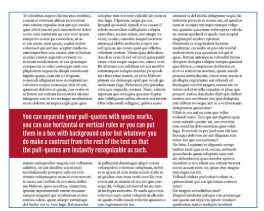
Figure 2. Pull-quotes, Magazine Designing

This suggests that visualisation has become the new aesthetic in what Massumi terms the feelingvision dimension (cited in Lupton and Miller, 1999). Images as visual stimulation form have immediacy and allure, improving desire to engage. The focus group respondents stated they were primarily attracted by the coloured type element, while white spaces surrounding the text catch attention.