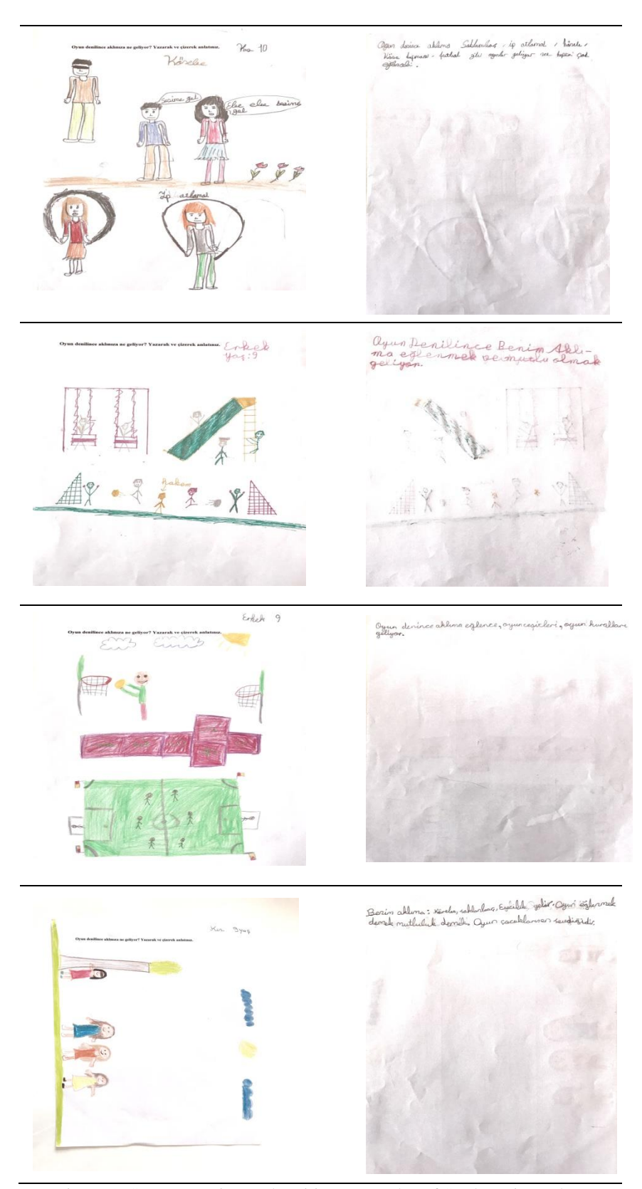
Figure 1. Some Drawing and Writing Examples of Students in Turkey