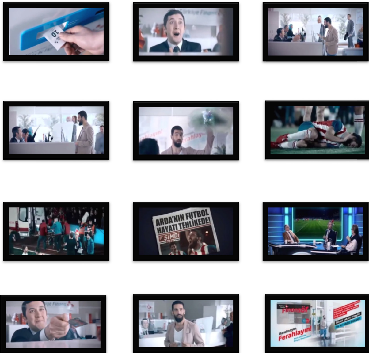
Figure 2. Turkish Finance Advertising Images

However, despite the fact that the use of celebrities in advertisements has a significant contribution to the corporate and brand image, this situation poses various risks. In particular, the most important of these risks are that the celebrity person may overwhelm the advertised brand and the message in the advertisement, the celebrities included in the advertisement campaign may get involved in an incident resulting in negative publicity, and the image of the celebrity in the advertisement may not overlap with the product advertised (Şimşek & Uğur, 2003). As it is the case for all sportsmen, Arda's public image follows a trend of sudden changes. It is possible that this ad may have a negative impact on the target audience during or after an important football match where Arda plays particularly badly. However, despite being a global player, Arda is a player who is associated with a prominent team (Galatasaray) on the national level. This situation may cause a negative perception of the bank by the supporters of other teams nationwide.