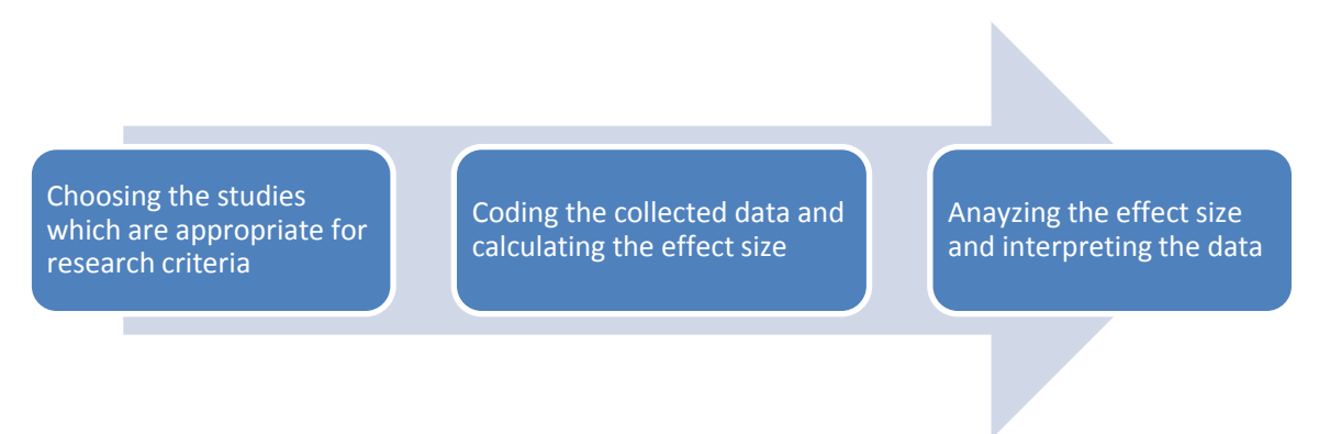
Figure 1. Meta-analysis process steps are adopted from Hoffler and Leutner (2007).

In this study, the meta-analysis method which gathers the results of different studies on the same specific topic and analyzes these findings statistically, is used. The analysis is conducted for reaching a new and general result by combining statistical findings from independent studies (Dincer, 2014). In general terms, Figure 1 schematizes the process steps of a meta-analysis.