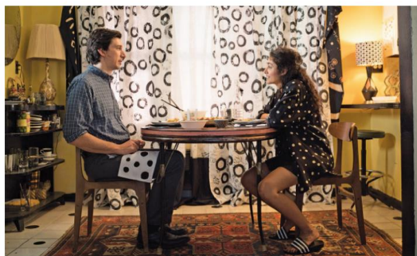
Figure 2. Still from film Paterson (Jarmusch, 2016)

Description: The intimate ensemble between Paterson and Laura in Paterson (Jarmusch & Quart, 2017).