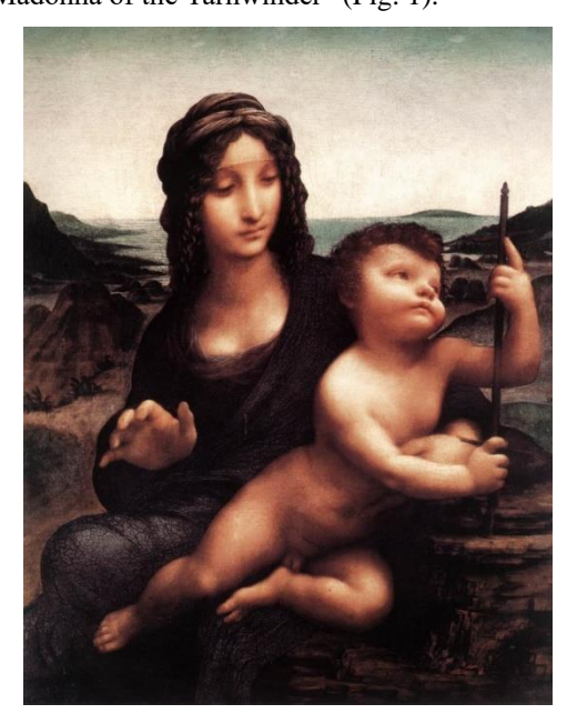
Figure 1. "The Madonna of the Yarnwinder" by Leonardo da Vinci

The object of this research is "The Madonna of the Yarnwinder" (Fig. 1).