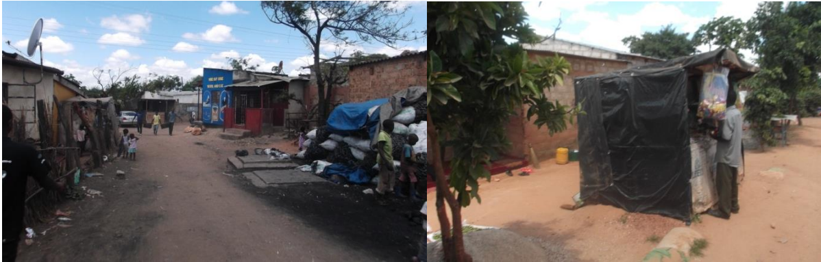
Figure 4. Typical Use of Space between Buildings in Ng’ombe komboni.

The open spaces along the roads as mentioned earlier are commonly used as trading areas for various goods, neighbourhood meeting places and children’s playing areas. These spaces have however assumed the informal role of dumping grounds for garbage. Even though there is a waste management system in place, it is common to see piles of garbage lining the neighbourhood streets.