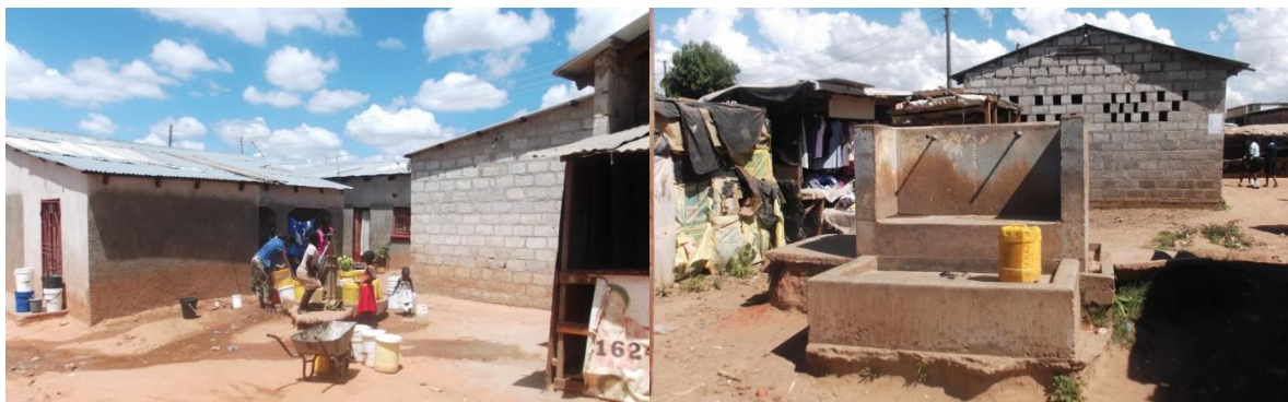
Figure 6. A borehole hand pump and disused water stand managed by the Water Trust in New Ng'ombe

During the study it was noted that Ng'ombe has no water and sewerage systems. This has led to an overdependence on pit latrines (85%) with only 15% residents having residential septic tank and soak-a-way sewerage systems. From the focus groups it was established that the Water Trust set up in the settlement provides communal water kiosks. Water wells were observed around the settlement despite community leaders discouraging their use due to risk of contamination and diseases. Water boreholes are also drilled on individual plots without planning control and safeguards to ensure it is treated for human consumption.