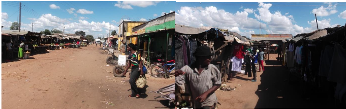
Figure 8. Main Commercial Activities Are Mainly Located Around the Market in New Ng'ombe

conducted within the dwelling, the neighbourhood or elsewhere in the city. Many residents earn their livelihoods through employment outside the neighbourhood. However, there are a number of informal economic activities that take place within the neighbourhood. Most residents are involved in the service and security industry as indicated in table 4. The other main employment demographics are the people engaged in the construction sector who seek employment in the nearby localities and in Ng'ombe. Another thriving economic activity is the provision of rental housing in the settlement by landlords. The WDC officials during the interview put the figure of rental housing in the settlement at 75% of the total housing stock. Commercial activities are concentrated at the two main designated markets in the settlement and along the main thoroughfares. These include numerous small shops, food outlets and used clothes stands. Home-Based Enterprises (HBEs) are also an important means of livelihood for a large proportion of Ng'ombe households. Residents make use of their homes for a range of economic activities such as subletting of rooms in houses, informal trading on residential premises and village industries such as welding and carpentry. Commercial activities of a recreational nature including bars, taverns, makeshift video gaming, gambling slot machines and betting halls are also common and are located near the main trading areas.