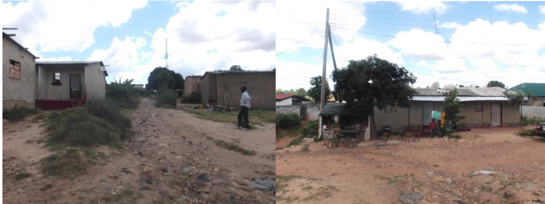
Figure 5. Dilapidated Road Network in Ng'ombe Kasisi komboni