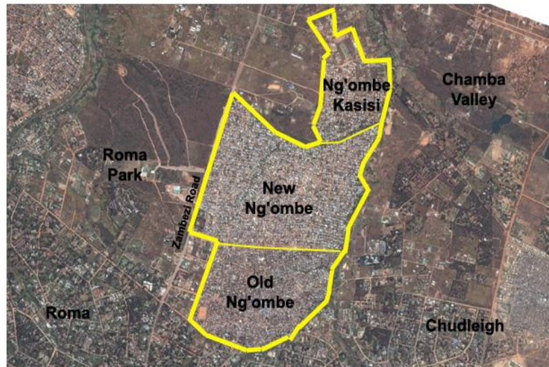
Figure 2. Ng'ombe Settlement and Surrounding Neighbourhoods

city settlement, an intermediate settlement and a Peri-urban or Peripheral settlement. Ng'ombe represents a peri-urban settlement used in the wider study. Ng'ombe informal settlement was selected based on its (i) relative peri-urban location farthest from the Central Business district (CBD) on the periphery of the City of Lusaka, (ii) its unusually high population density, (iii) the unlimited and ever expanding settlement size, (iv) limited state-led development interventions, (v) the partially ordered building clustering of the settlement and (vi) existing tenant-building owner /landlord traits of the settlement.