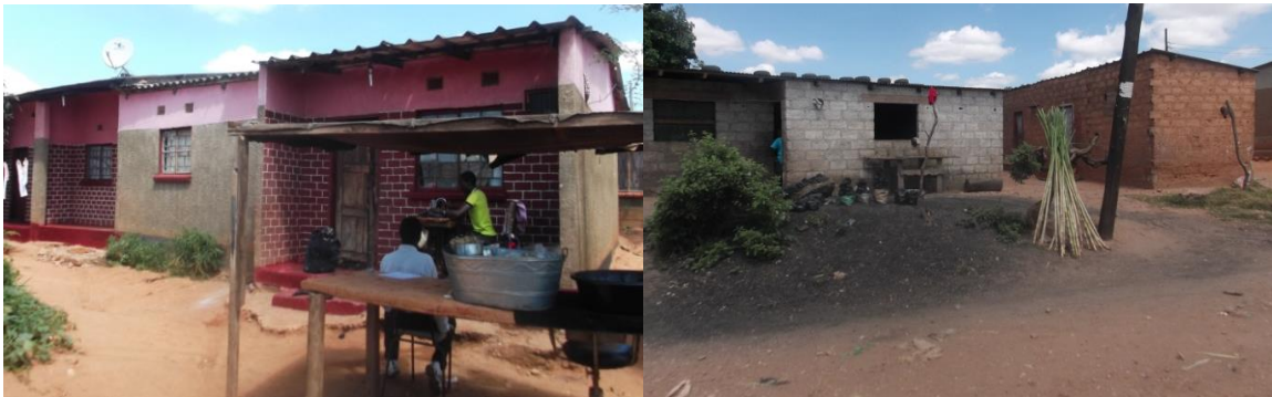
Figure 3. A tailoring business in New Ng'ombe with a food kiosk (Ntemba) in the foreground on a rental housing unit and; sugarcane and charcoal stand in front of 2 unfinished but occupied dwellings

Open spaces within the clusters of building have transformed over the years in response to population and economic pressures. In the original grid-ironed Ng'ombe site and service planning layout, circulation and access had prominence over open spaces for other activities. The open spaces in between residences have been built over and the only remaining open spaces are incidental spaces where houses cannot be built.