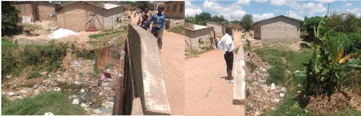
Figure 7. Garbage Dumping on Bridge Linking New Ng'ombe to Ng'ombe-Kasisi