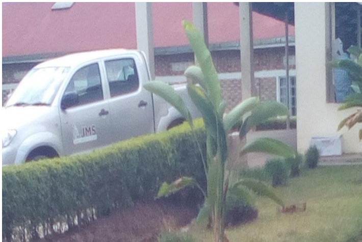
Joint Medical Store delivering drugs at RMH