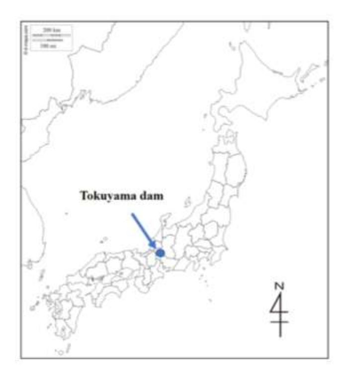
Figure 2. Location of the Tokuyama dam