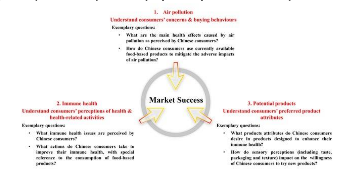
Figure 2. Road map for further research (with exemplary questions) to support the commercial success of functional food products designed to enhance the immune health of people facing persistent air pollution

A road map for further research to support the commercial success of functional food products designed to help the immune health of people facing persistent air pollution is shown in Figure 2 in which future research questions are summarised under the following three points: air pollution, immune health and potential products. Market success will require an integrated understanding of consumers' perceptions of air pollution, health and related products.