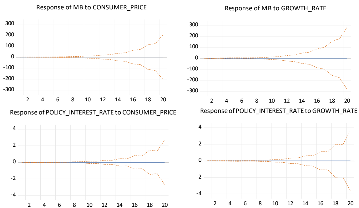
Figure 1. Impulse response

The results are clear. The effects of the shock of monetary base and policy interest rate on consumer price and on growth rate appear a few years later. Finally, the real data' deviation from the McCallum rule and the Taylor rule is calculated. The deviation is the theoretical value calculated by the right side of the equations (3) and (4) minus the real value. Case 1 is the case of McCallum rule, and Case 2 is the case of Taylor rule. Using these variables, the equations are performed.