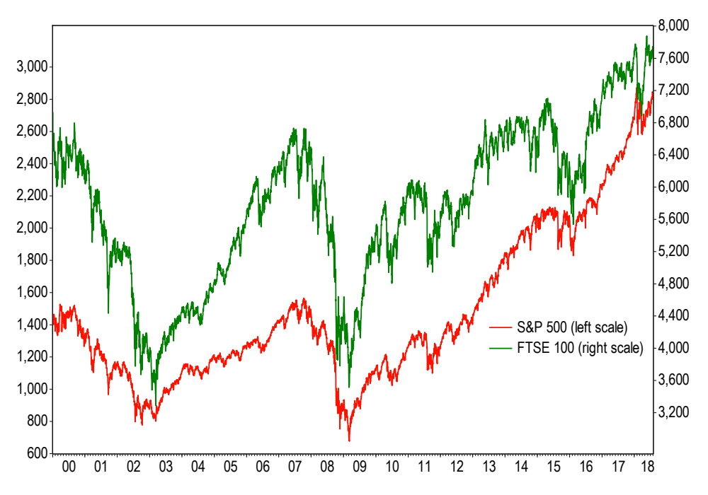
Figure 1. Evolution of S&P 500 and FTSE 100: From January 3, 2000 to August 2, 2018

As above, recent studies suggested the importance of taking into consideration structural breaks. Thus, in this paper, we quantitatively examine the US and UK stock returns by controlling structural breaks by using dummy variables in below sections.